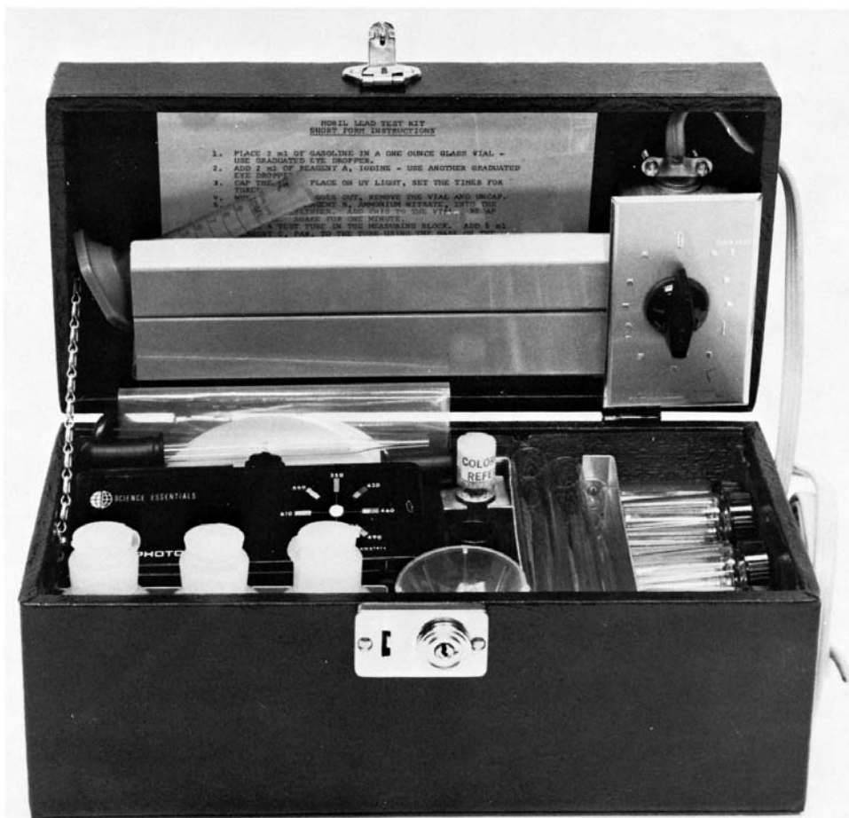
FIG. 1 Mobil Lead Test Kit

6.3 Colorimeter, Portable , capable of operating at 490 nm. Any equivalent instrument capable of measurement near 514 nm (the optimum Pb-PAR complex wavelength) may be used.