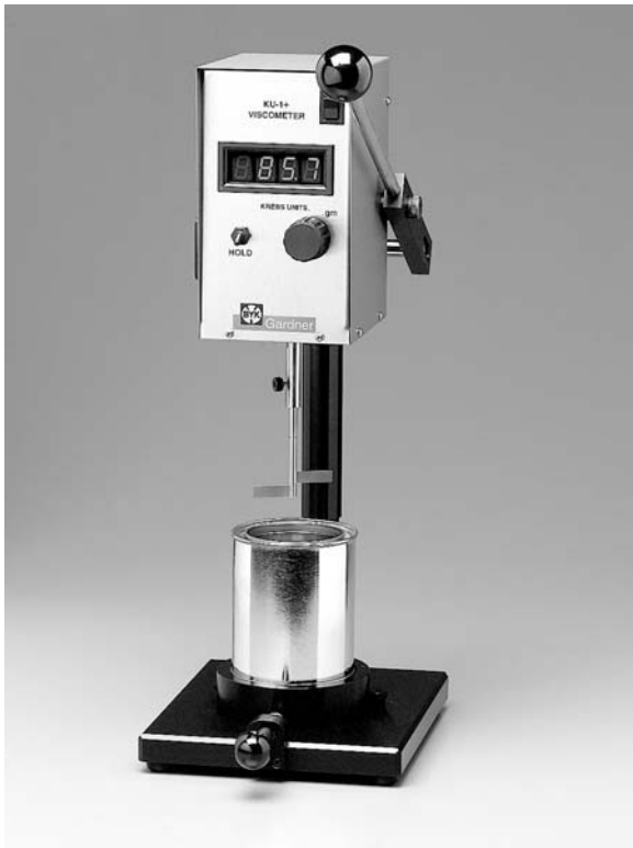
FIG. 5 Digital Stormer-Type Viscometer

the immersion groove on the paddle shaft. The paddle will start rotating when it is within about 12 mm (½ in.) of the lower position.