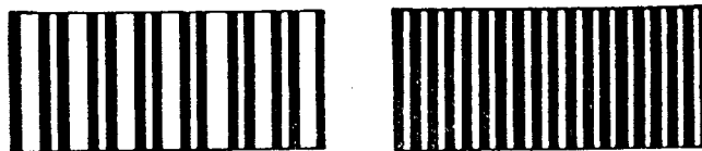
FIG. 4 Stroboscopic Lines Appearing as Multiples that May be Observed Before 200-r/min Reached