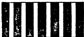
FIG. 3 Stroboscopic Lines Opening When Timer is Adjusted to Exactly 200 r/min

NOTE 4—Table 1 has been constructed so that it is not necessary to interpolate between loads to obtain the KU corresponding to the load to produce 100 revolutions in 30 s. The table provides KU values computed for a range of 27 to 33 s for 100 revolutions.