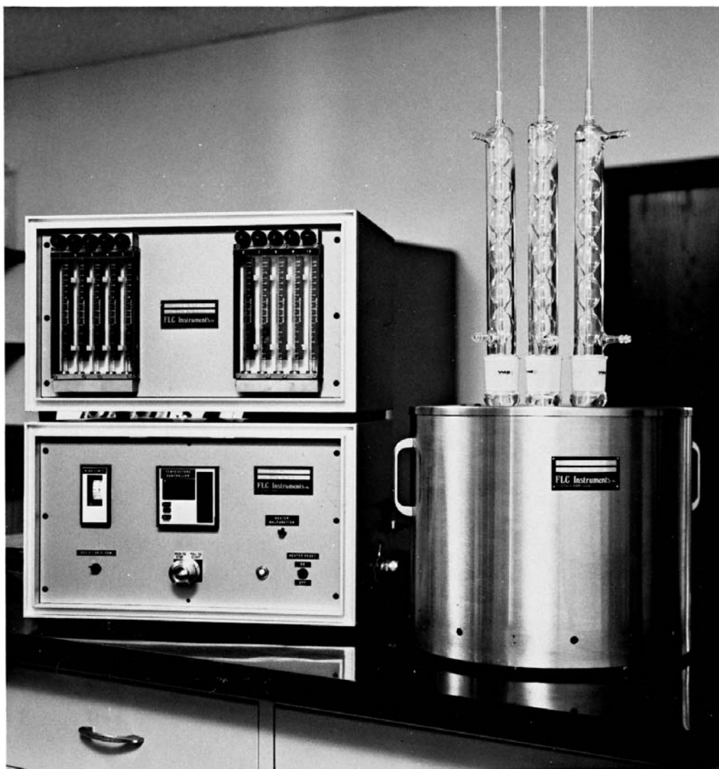
FIG. 1 Universal Oxidation Test Apparatus

sufficiently flexible so that new test conditions can be chosen in response to the changing demands of the marketplace.