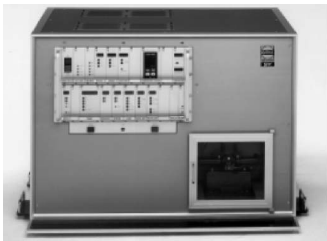
FIG. 1 SRV Test Machine, Model III