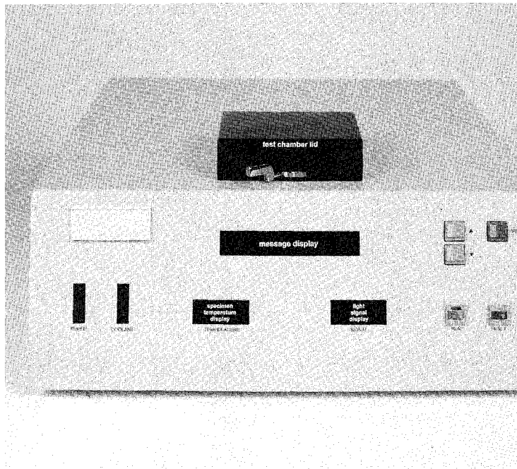
FIG. A1.3 Apparatus Exterior