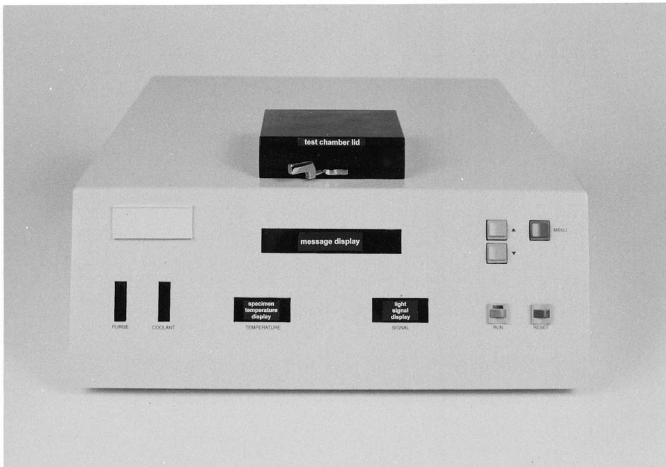
FIG. A1.3 Apparatus Exterior