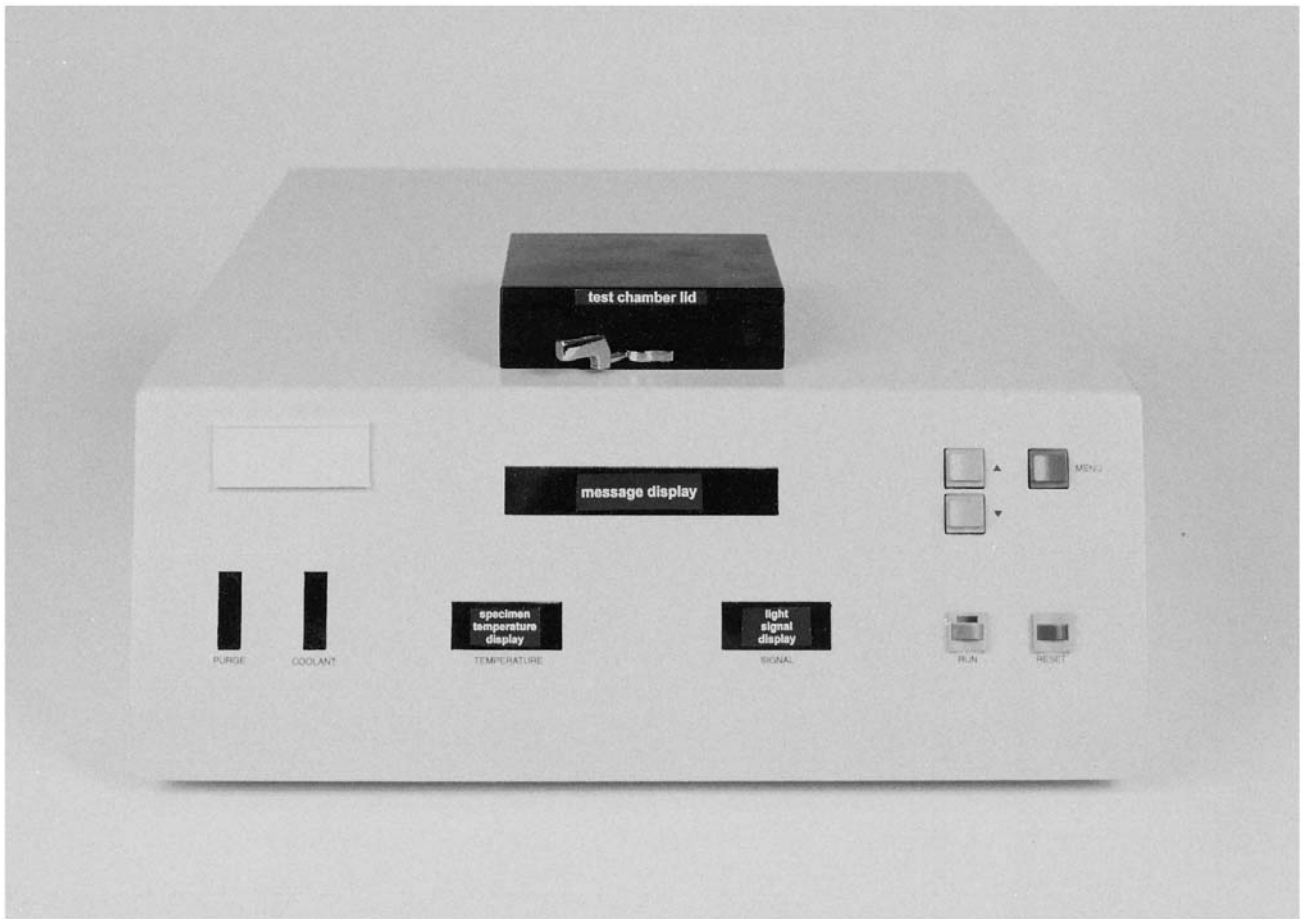
FIG. A1.3 Apparatus Exterior

thermal contact with the bottom of the specimen cup, the specimen will be chilled. The bottom of the Peltier device is in thermal contact with the heat sink, where heat is dissipated to the cooling media. During specimen warming, the reverse process will take place.