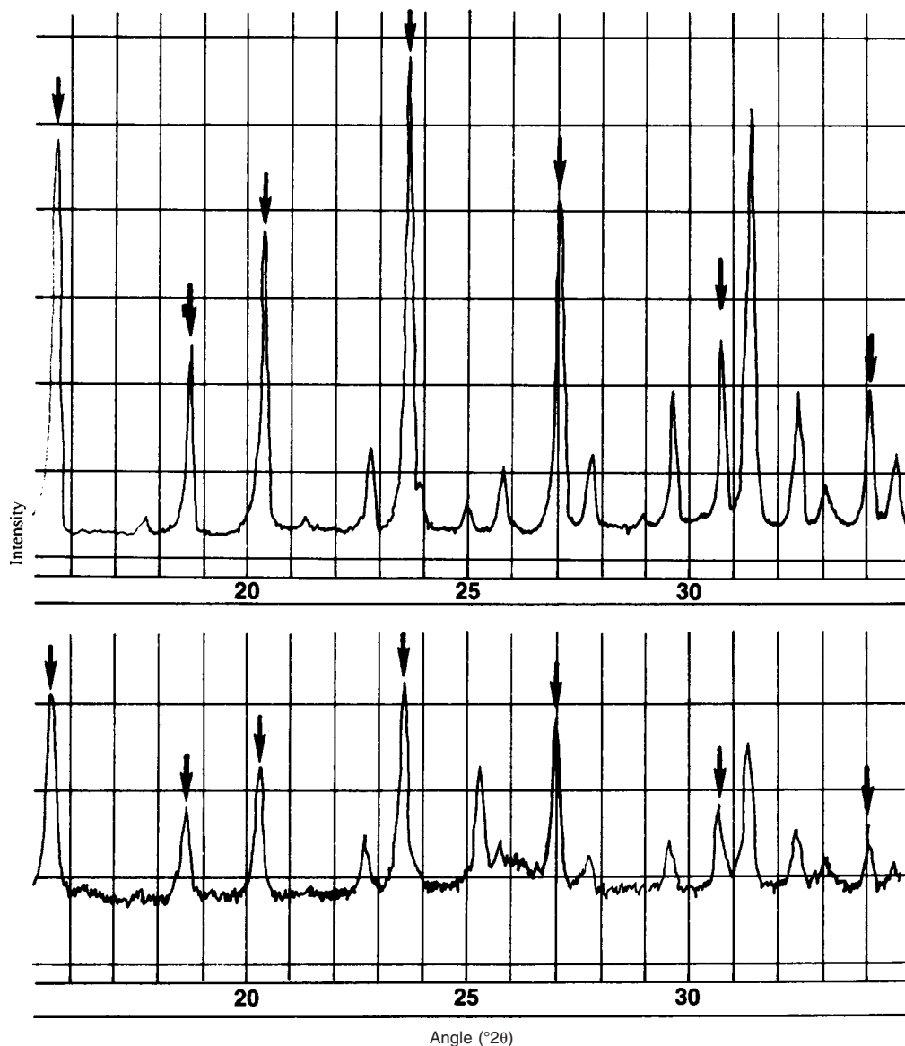
FIG. 1 X-Ray Diffraction Patterns of ASTM Zeolite Samples Upper—NaY; Lower—Cracking Catalyst Intensity

electron density distribution is dependent upon the extent of filling of pores in the zeolite with guest molecules, and on the nature of the guest molecules. In this XRD method, the guest molecule H_2O completely fills the pores. Intensity changes may also result if some or all of the cations in Y and X are exchanged by other cations.